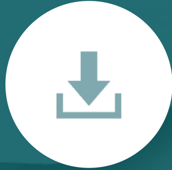
TABLE CHANGES PUBLISHED ON 7/23/2024 AND 9/16/2024